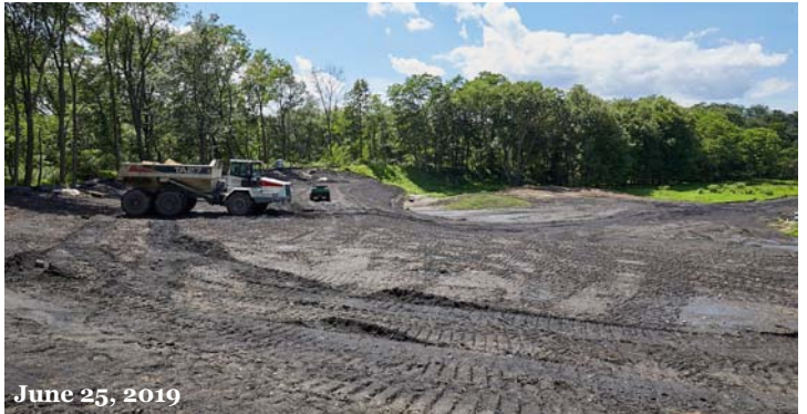
June 25, 2019