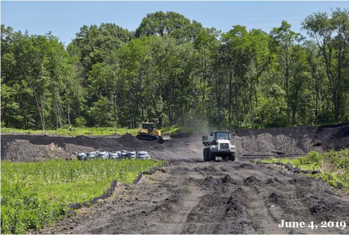
June 4, 2019