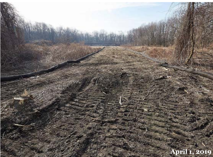
April 1, 2019