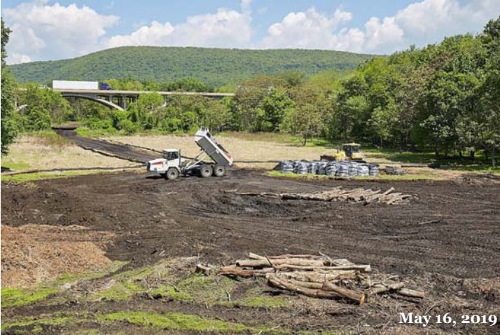
May 16, 2019