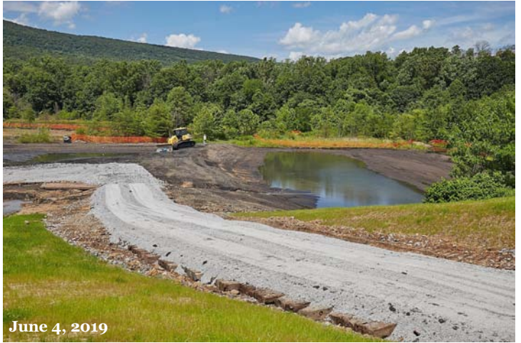
June 4, 2019