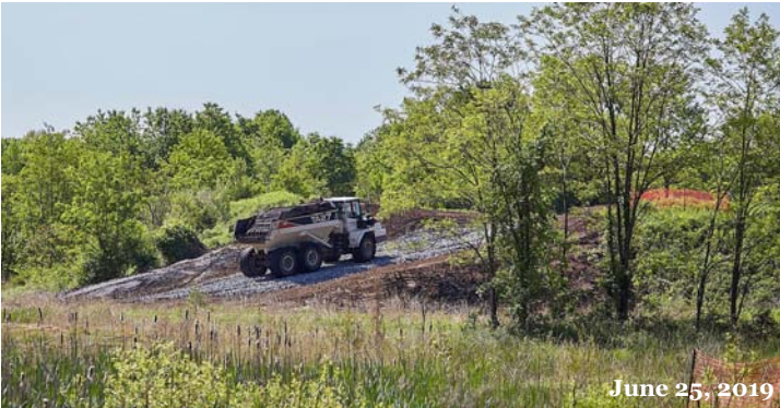
June 25, 2019