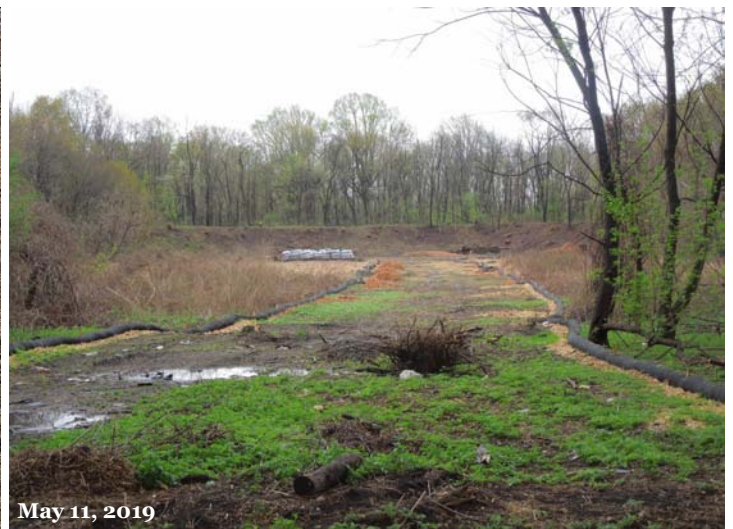
May 11, 2019