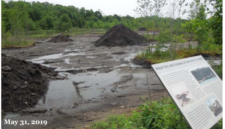
May 31, 2019