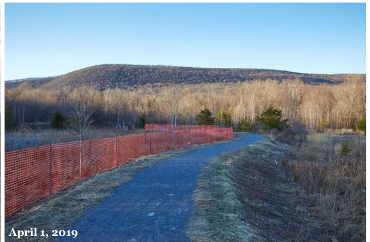
April 1, 2019