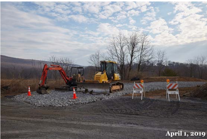
April 1, 2019

The project is due to be completed next year, so watch as the new wetlands come to life!