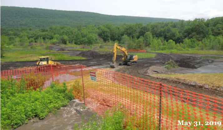
May 31, 2019