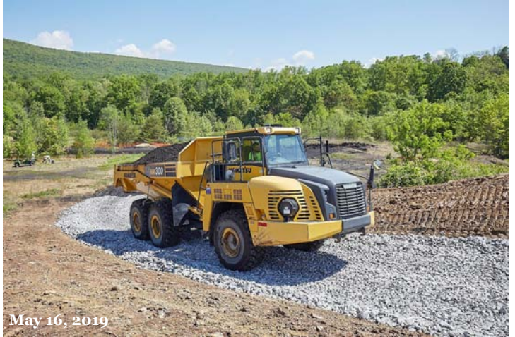
May 16, 2019